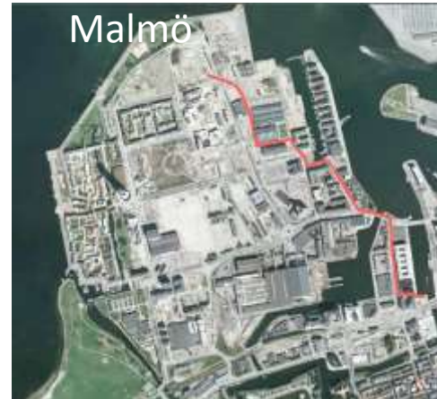
The Line Nordic City Network, Stadsbyggnadskontoret, ISU, mfl